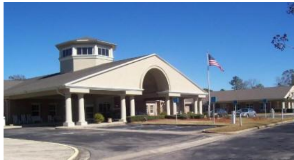
William F. Green State Veterans Home

300 Faulkner Drive, Bay Minette, AL 36507-1461 Tel: (251) 937-8049/2472F