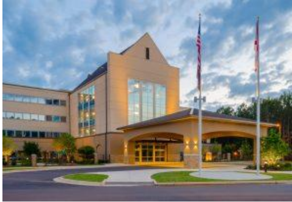
Bill Nichols State Veterans Home

1784 Elkahatchee Road, Alexander City, AL 35010 Tel: (256) 329-3311/3350F