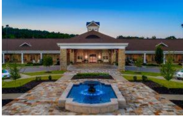
Colonel Robert L. Howard State Veterans Home 7054 Veterans Parkway, Pell City, AL 35125 Tel: (205) 338-6487

Go to http://www.va.state.al.us/VeteransHome.aspx or https://va.alabama.gov/vets-home-program to learn more about the Alabama Veterans' Home Program.