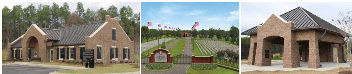
Alabama State Veterans Memorial Cemetery, 34904 Alabama Highway 225, Spanish Fort, AL 36577 Tel: (251) 625-1338 Website: www.va.alabama.gov

The Alabama State Veterans Memorial Cemetery at Spanish Fort sits on over 120 acres of land in Baldwin County, Alabama. The cemetery was dedicated in December 2012 and began interments in April 2013. The initial phase of the cemetery is 22.8 acres and has 2,776 burial sites (2,392 in-ground). The lifespan of the entire cemetery is 100 years. A cemetery brochure is available at https://va.alabama.gov/wp-content/uploads/2020/01/Cemetery-Brochure-corrected.pdf .