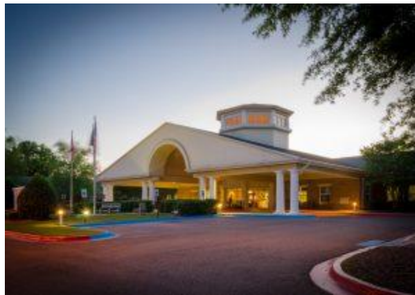
Floyd E. "Tut" Fann Veterans Home

2701 Meridian Street, Huntsville, AL 35811 Tel: (256) 851-2807/2967F